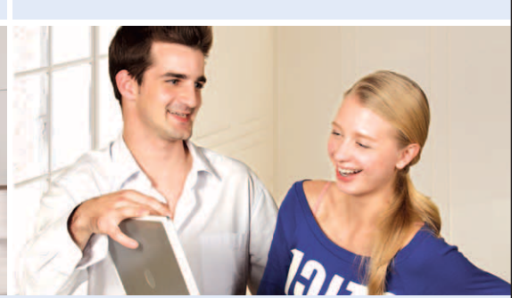
*(For specific compatibility list, please visit our website: http://www.tp-link.com/products/ps.asp)