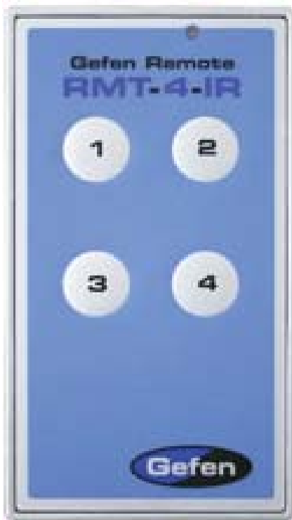
Optional RMT-4 wired remote control and IR extender eye.

Plug in the IR extender eye to the extender port on the back of the switcher. As soon as the IR extender eye is plugged in you can extend your IR signal. The IR extender eye does not come included in the package.