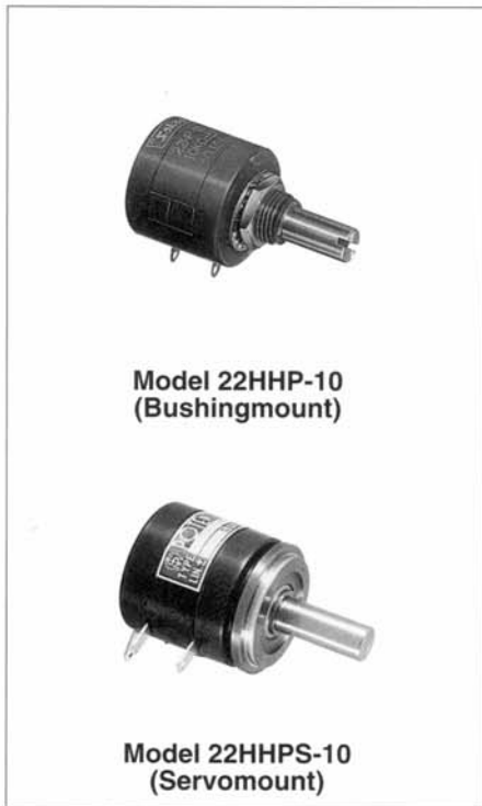
Model 22HHP-10 (Bushingmount)