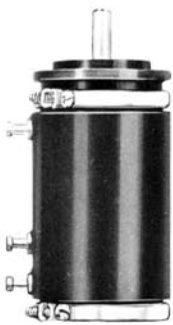
SERVO MOUNT/BALL BEARING MODEL 3701