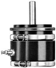
SERVO MOUNT/BALL BEARING MODEL 2501