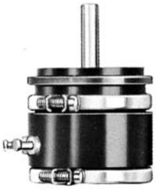
SERVO MOUNT/BALL BEARING MODEL 1701