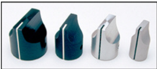
HD90 - Black Gloss, HD75 - Black Matte & Clear Gloss, HD50 - Clear Matte

HD Series: The design of the "HD Series" knob is unmistakably unique. The taller profile of this knob, along with ergonomically designed finger surface, distinguishes its self as a knob that has been specified on 1000's of high-end front panel applications. Partial top and full-length side saw cut indicator line. Two 6-32 set screws.