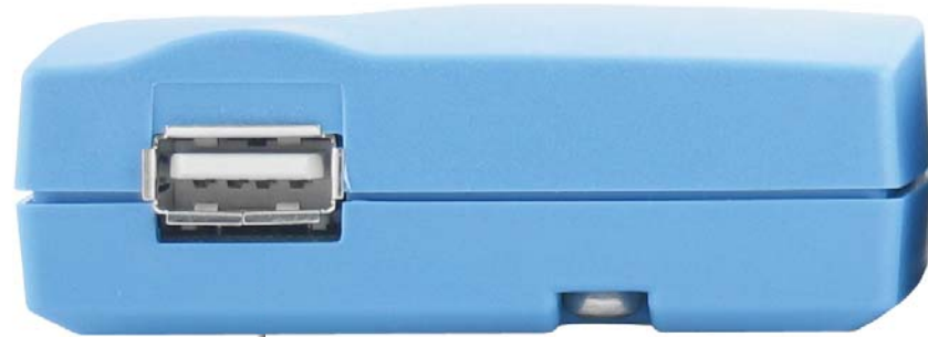
1 port USB Hub connects to USB devices