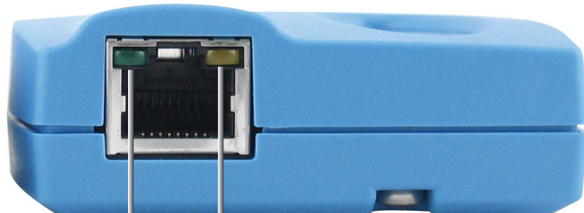
Device LED (green) Link LED (yellow)