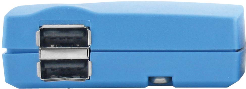
2 port USB Hub connects to USB devices