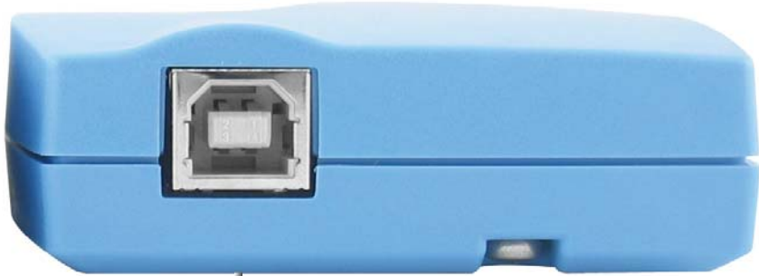
USB In from computer