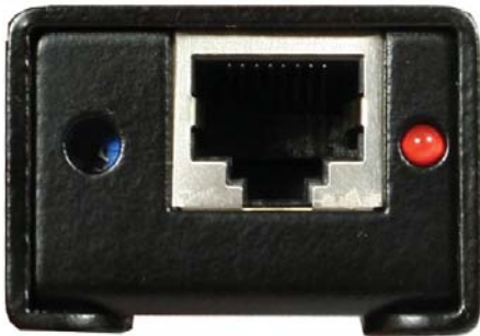
EQ Knob Video CAT5 In Power LED