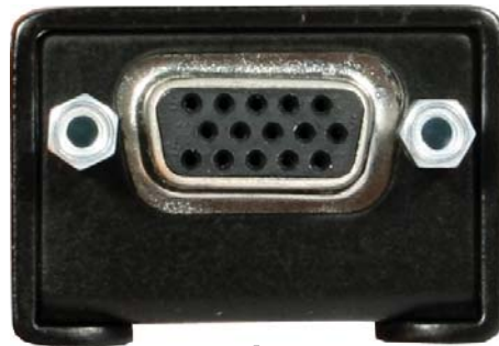
VGA to Component Cable Out