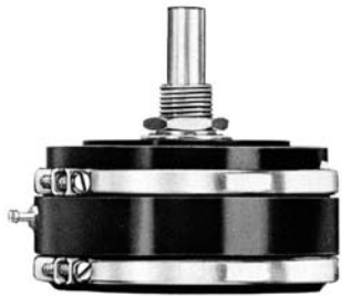
BUSHING MOUNT/SLEEVE BEARING MODEL 1522