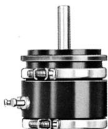
SERVO MOUNT/BALL BEARING MODEL 1301